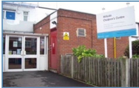
Hillside Children's Centre