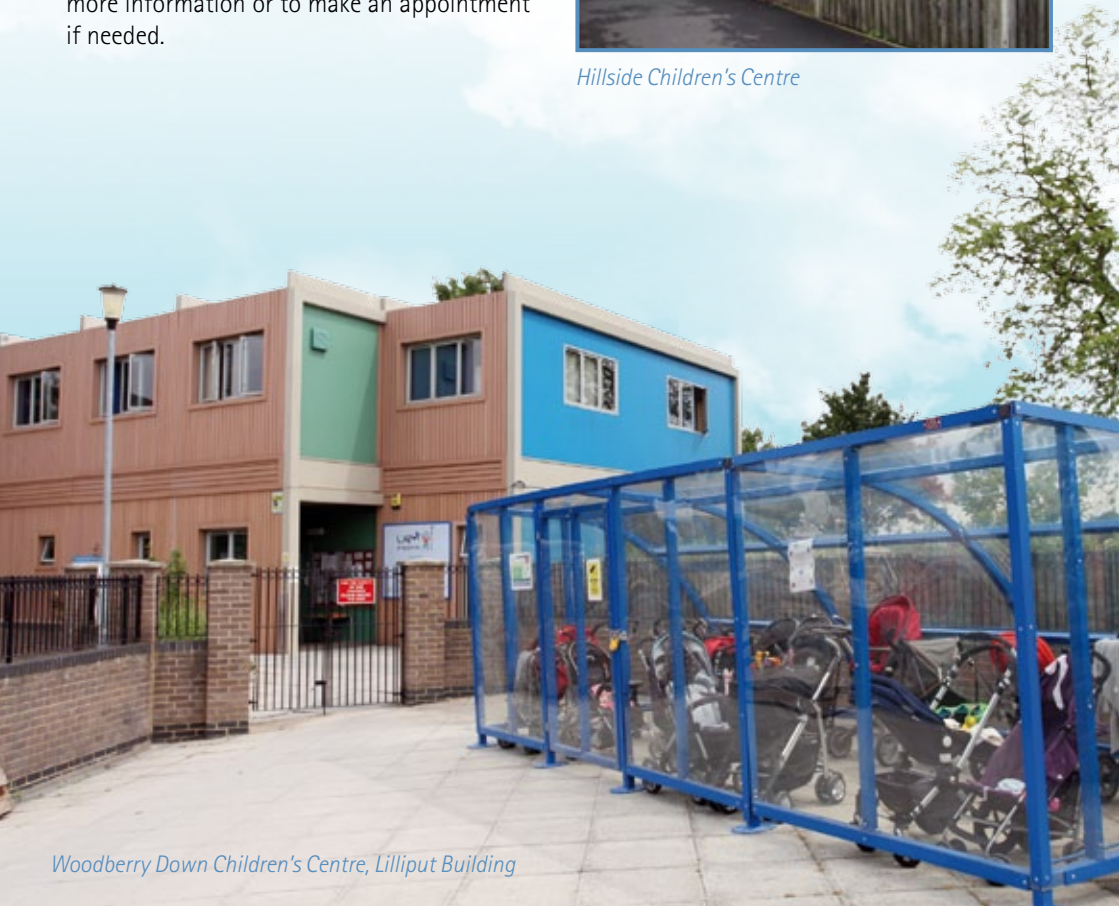
Woodberry Down Children's Centre, Lilliput Building