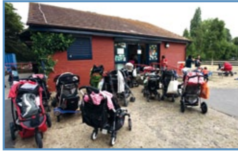
Clissold One O'clock Club

This guide will take you through all the activities, services and courses that our children's centres provide. Most of the services are free, just call us on 020 8815 3270 for more information or to make an appointment if needed.